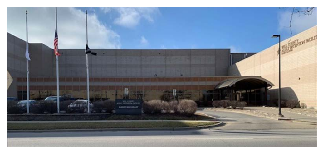
Main Public Entrance at WC Adult Detention Facility, 95 S. Chicago St. Joliet, IL

The County is currently seeking proposals from qualified and experienced firms to develop plans and specifications necessary for competitively bidding a new roof and exterior masonry repairs for the ADF, including the Video Visitation Building (VVB) located east of the ADF at 20 S. Chicago Street, Joliet, IL, 60432.