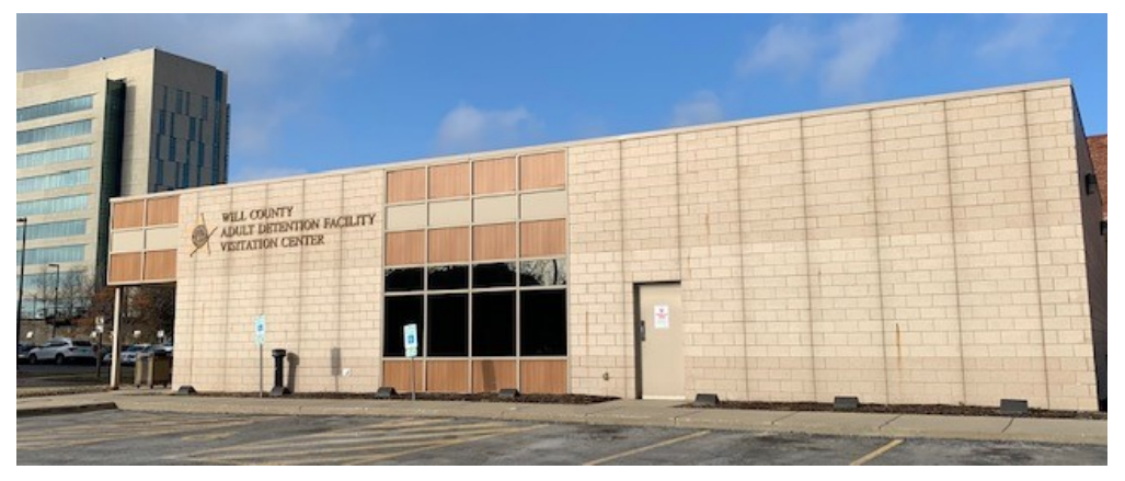
South Elevation at WC Video Visitation Building, 20 S. Chicago St. Joliet, IL